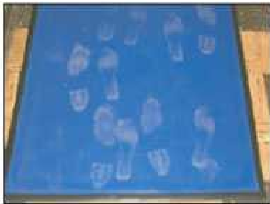
D-Step™ Mats remove dust from shoes in three easy steps.

Clean D-Step™ Mats at least once per day. Clean more frequently when heavy traffic creates a noticeable reduction in the surface's adhesiveness.