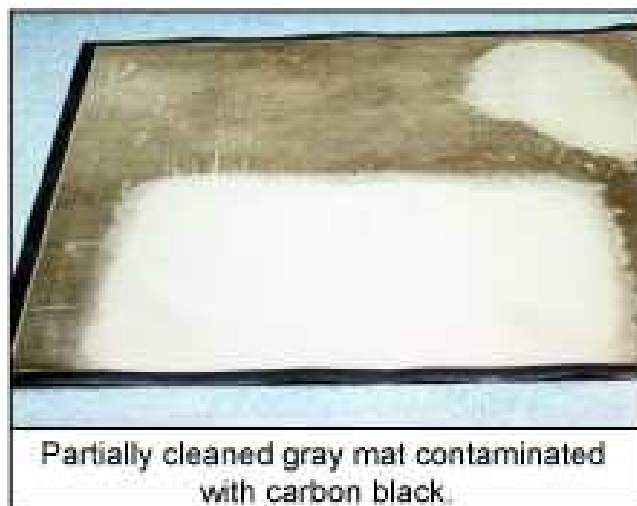
Partially cleaned gray mat contaminated with carbon black.

Carbon black or graphite may build up on the mat. This build up will reduce the adhesiveness of the mat. If this occurs, call ESCA Tech to order Formula 9 Cleaner (4490ES) to remove the carbon black and restore the adhesiveness.